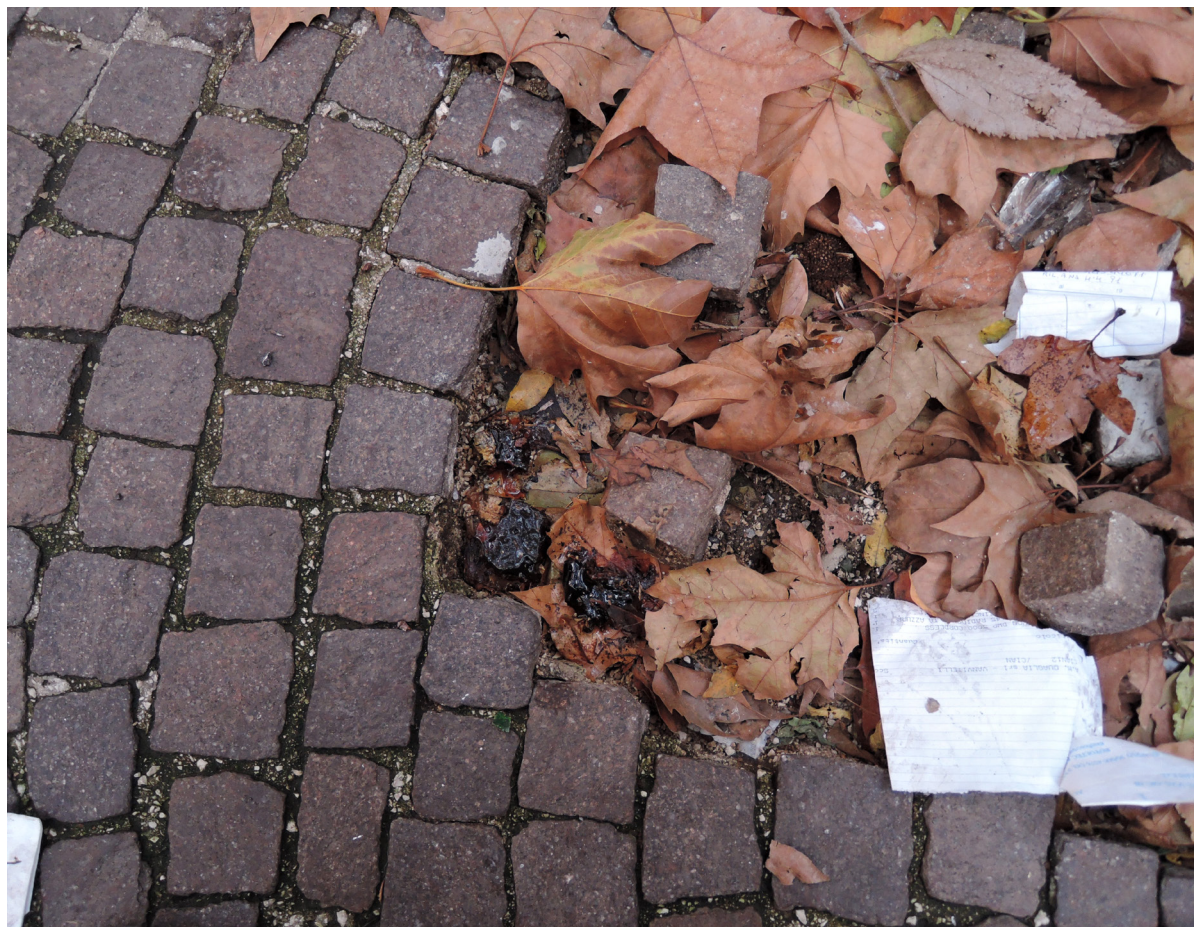
VIA RAFFAELE MORGHEN / QUART.VOMERO / FIRST VISIT / 25. NOV. 2019