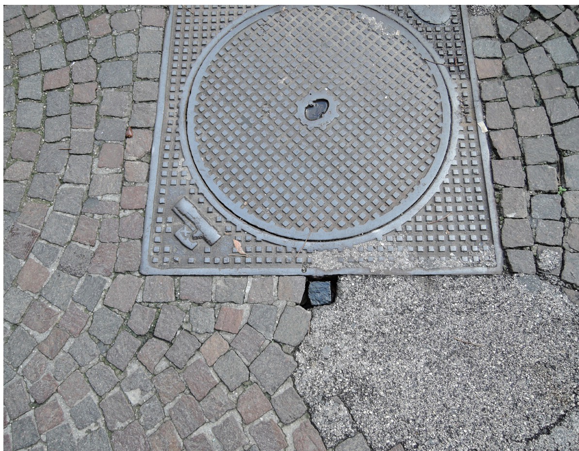
VIA AGOSTINO DEPRETIS / QUART.PORTO / SETTLEMENT / 22. NOV. 2019