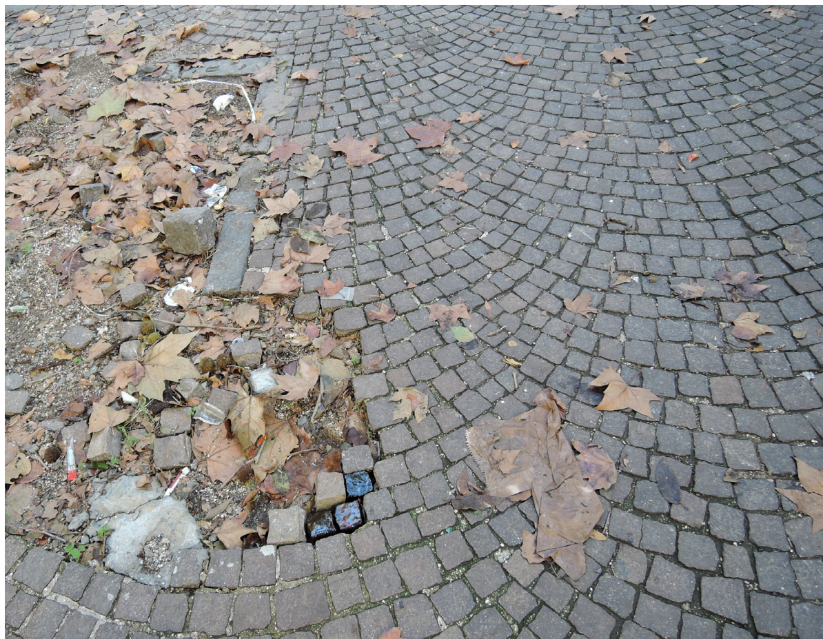
VIA RAFFAELE MORGHEN / QUART.VOMERO / SETTLEMENT / 22. NOV. 2019