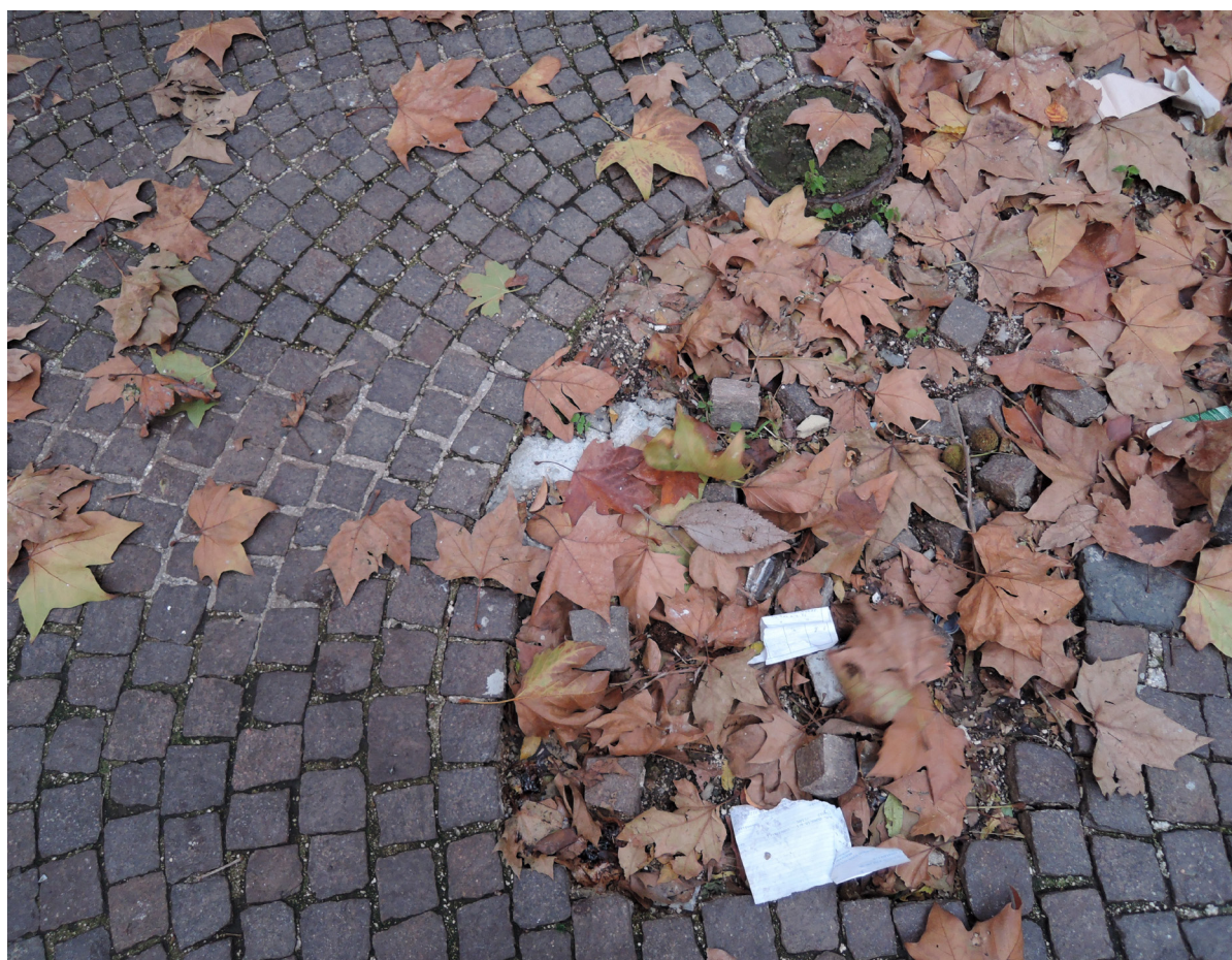
VIA RAFFAELE MORGHEN / QUART.VOMERO / FIRST VISIT / 25. NOV. 2019