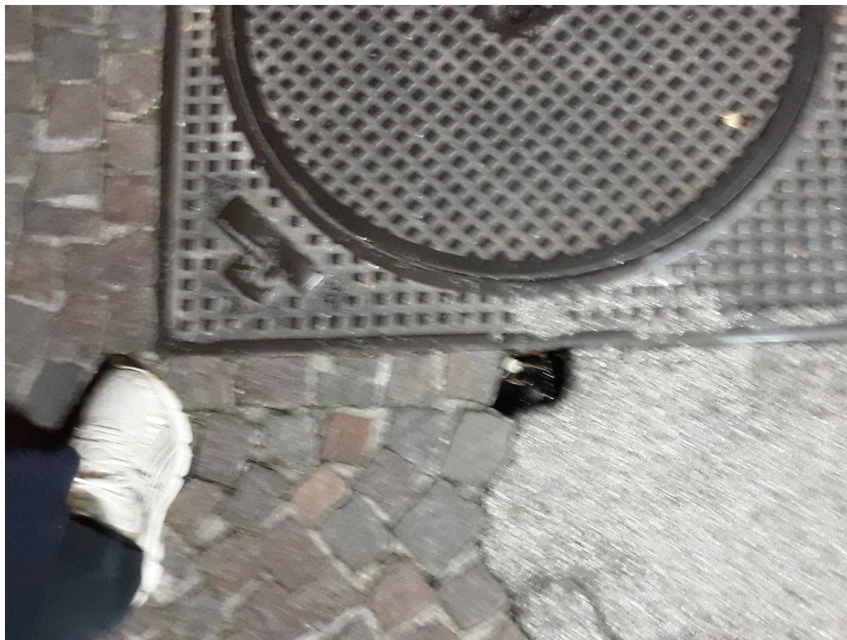
VIA AGOSTINO DEPRETIS / QUART.PORTO / FIRST VISIT / 23. NOV. 2019