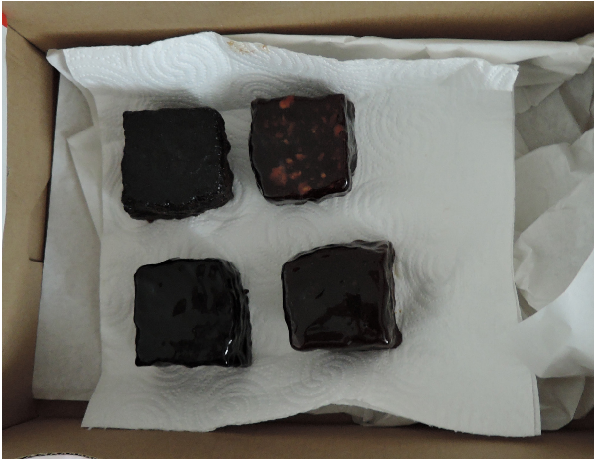
CASTS OF FOUR SANPIETRINI / CARAMELIZED SUGAR