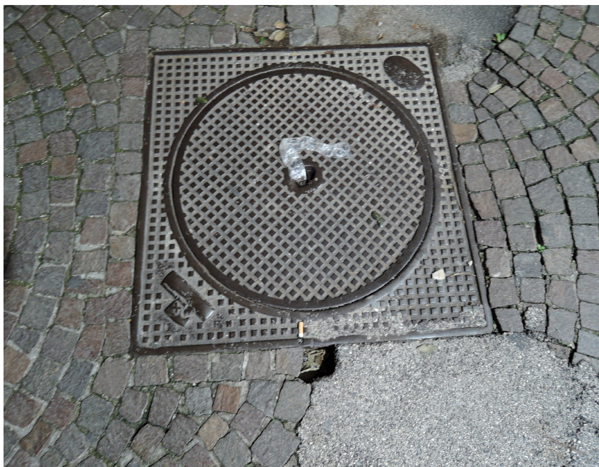
VIA AGOSTINO DEPRETIS / QUART.PORTO / SECOND VISIT / 25. NOV. 2019