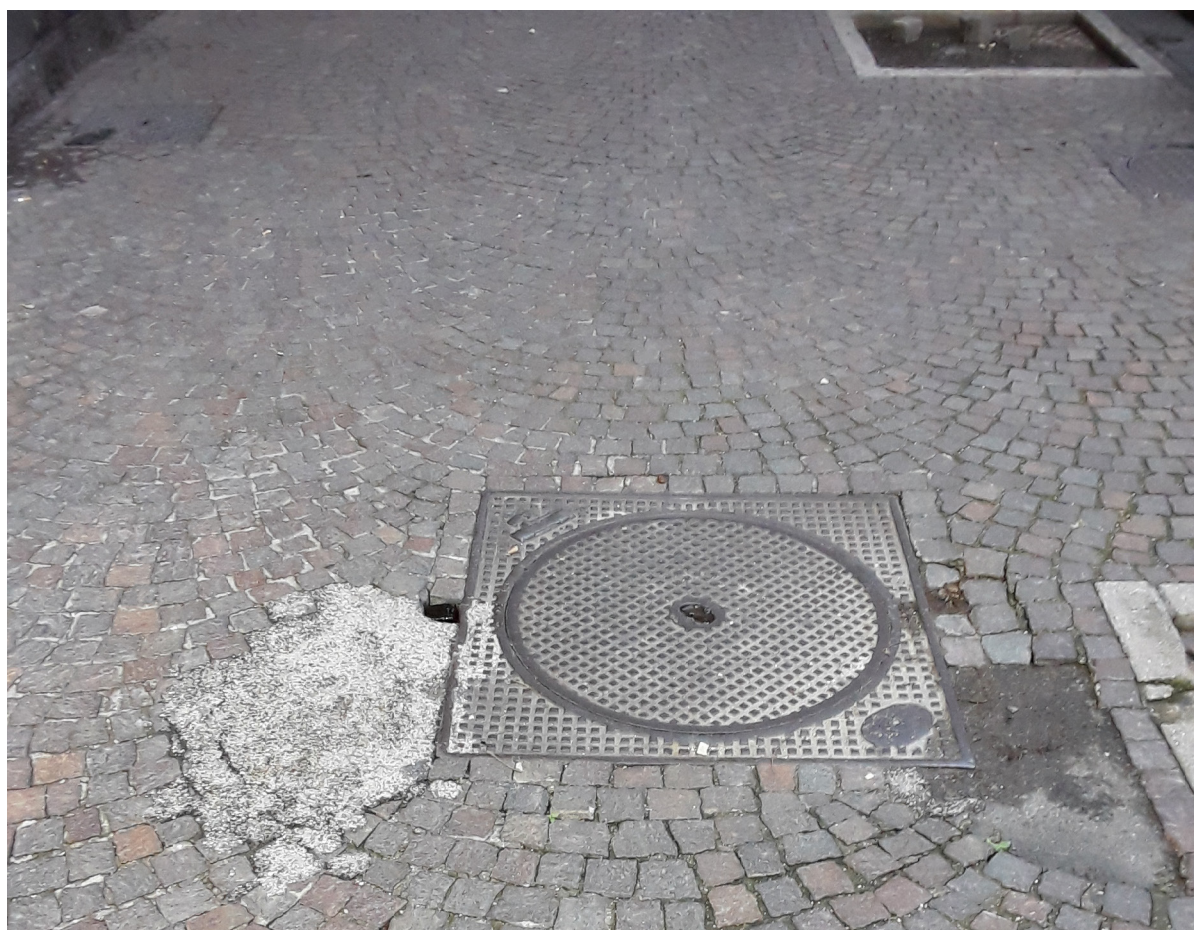
VIA AGOSTINO DEPRETIS / QUART.PORTO / FIRST VISIT / 23. NOV. 2019